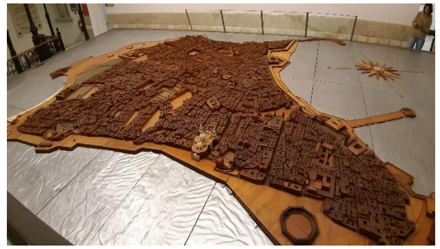
Constitution of Cádiz.

In Museum of Cádiz is a famous replica of city of Cádiz, which was made in 1779. It's made of expensive wood and the main monument, Cathedral in Cádiz, is made of marble. It's